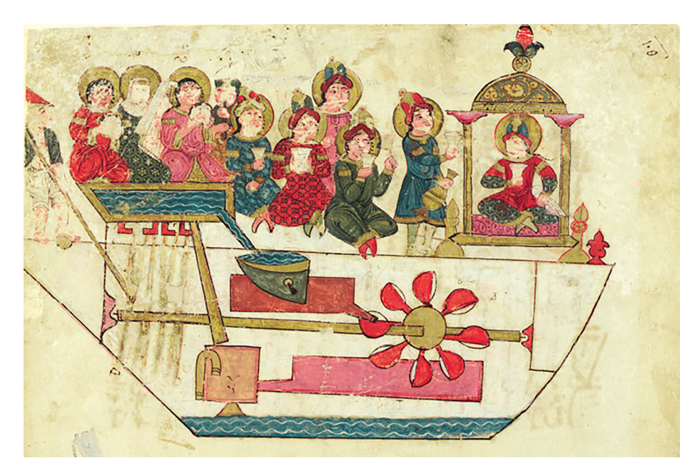
Figure 1: Picture of one of al-Jazari's automatic machines: a musical toy in the form of a boat. From a manuscript of his book copied in Syria in 715 H/1315 CE (opaque watercolour, ink and gold on paper)

Donald R. Hill, the English historian who was an academic authority in the history of Islamic mechanics and engineering, wrote in Studies in Medieval Islamic Technology: "It is impossible to over-emphasize the importance of al-Jazari's work in the history of engineering. Until modern times there is no other document from any cultural area that provides a comparable wealth of instructions for the design, manufacture and assembly of machines